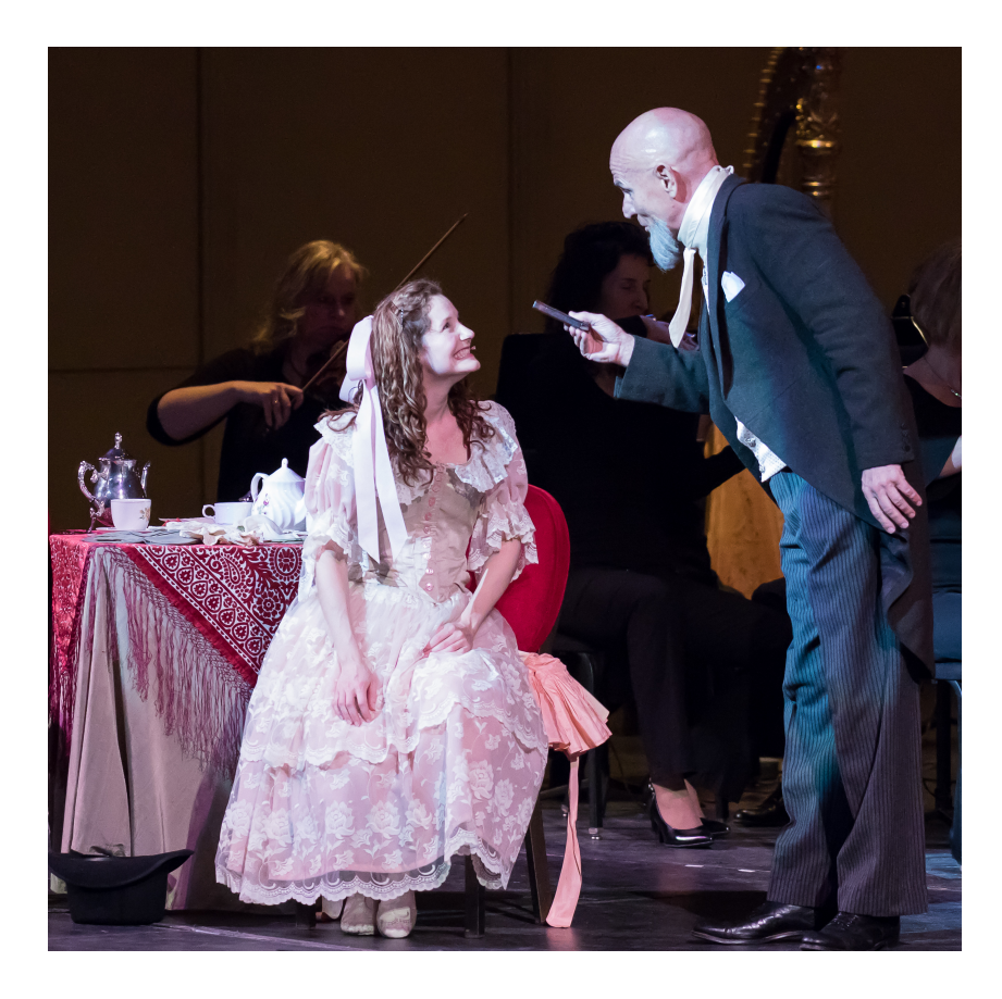
"There's an electric energy in this country... all these people, so generous and open-hearted... their ideas, their dreams, their music... all flowing together like a mighty river - everything tumbling toward the future."